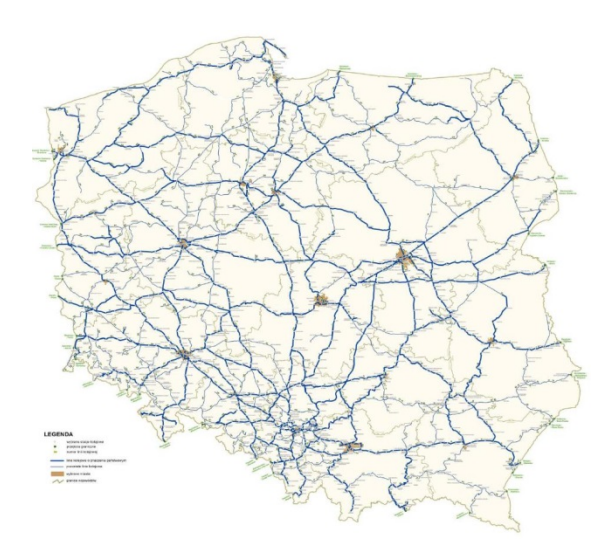
Figure 2. Railway network in Poland