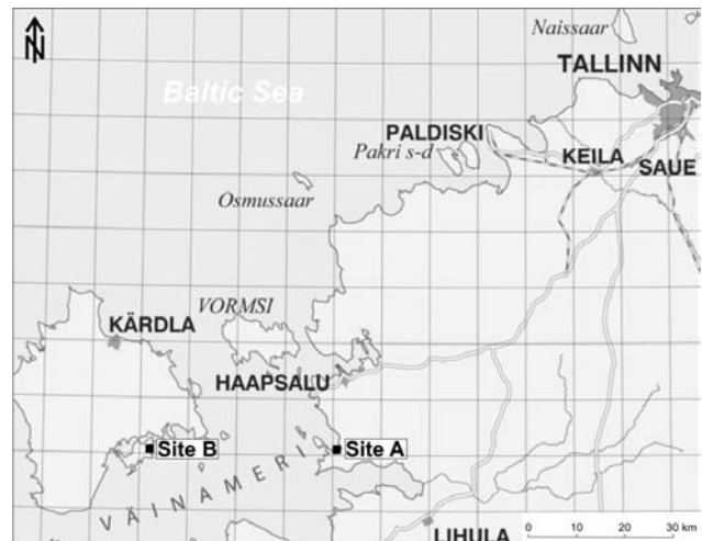
Figure 1. Location of the study sites

The study sites were characterized by the occurrence of surface bipartite deposits consisted of marine sediments overlaying moraine till. Results of grain-size distribution analyses allowed to determine the thickness of the marine sediments. It ranged from 5 to 23 cm in Põgari-Sassi and from 29 to 47 cm in Kassari, clearly increasing towards the bay. The terrain was flat with very slight inclination towards the sea basin, which was very shallow. For example, in site B water depth in the distance of 600 m from the shoreline was only 55 cm. It suggested that there was a lodgment till in the base (Kalm & Kadastik 2001). Fig-