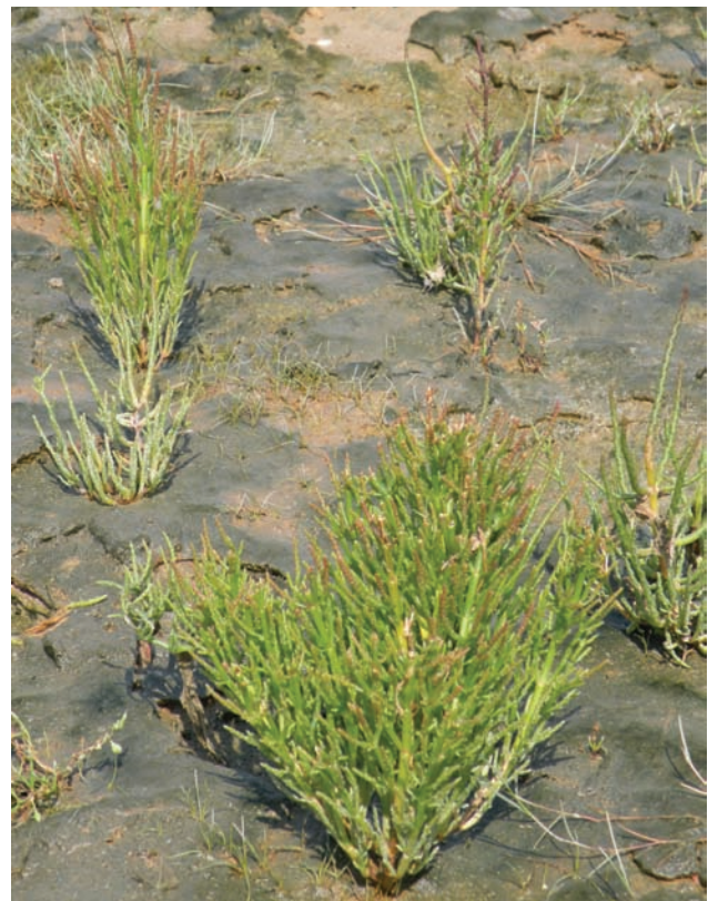
Figure 4. Salicornia europaea growing in the pioneer zone (site B)

As described above, specific environmental relationships in the studied coastal lagoons play a fundamental role in the occurrence of common glasswort and also other halophilous plants (Fig. 3). Salicornia europaea was present in the first pioneer vegetation zone next to the sea water table (Fig. 4). This plant was also found growing mostly in small flat depressions (site B), where the water stagnates longer than in adjacent areas. During the June–July–August more than 5 times the Salicornia europaea – sites are under the water during several days. Salicornia europaea was accompanied by Spergularia salina , Glaux maritima , Plantago maritima and Puccinellia maritima . Total vegetation cover in this zone not exceed 5%. The next zone – salt marsh meadows were dominated by Juncus gerardi but the patches with Salicornia europaea were present there as well. The total vegetation cover in this patches was ca. 30–40% and Salicornia europaea was assessed as abundant with cover 5–10% (1–2 in Braun-Blanquet scale). In the Salicornia europaea patches Suaeda maritima , Halimone pedunculata , Plantago maritima , Puccinellia maritima , Spergularia salina and Juncus gerardi were noted.