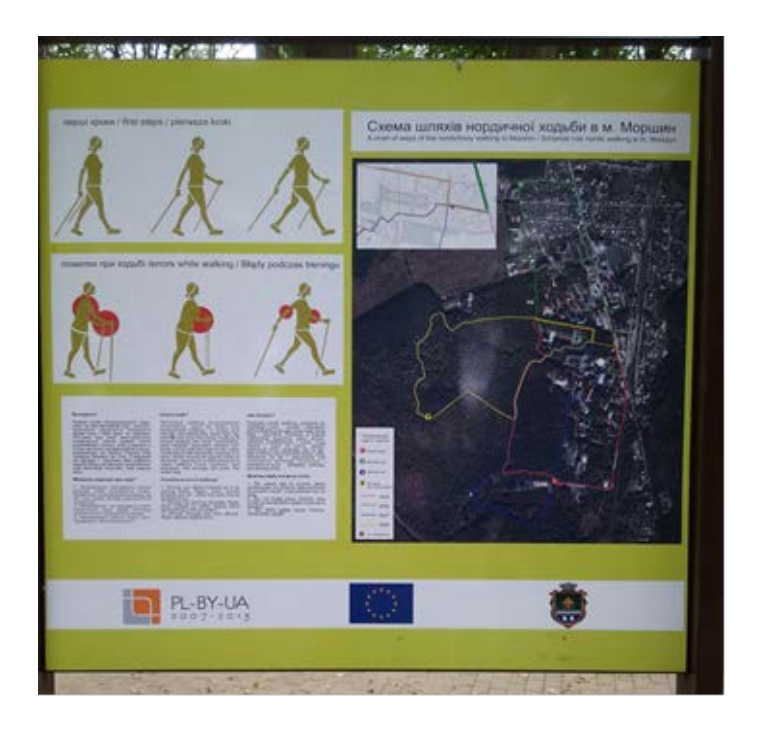
Figure 3. Diagram of the ways Nordic walking in Morshyn

The territory of the city of Morshyn is promising for the creation of urban green routes. Near the sanatorium "Marble Palace" is a trail for Nordic walking. There is a scheme with indications and contraindications, which is used by vacationers for the purpose of recovery, and patients – on prescription – in complex rehabilitation treatment on the territory (Fig. 3).