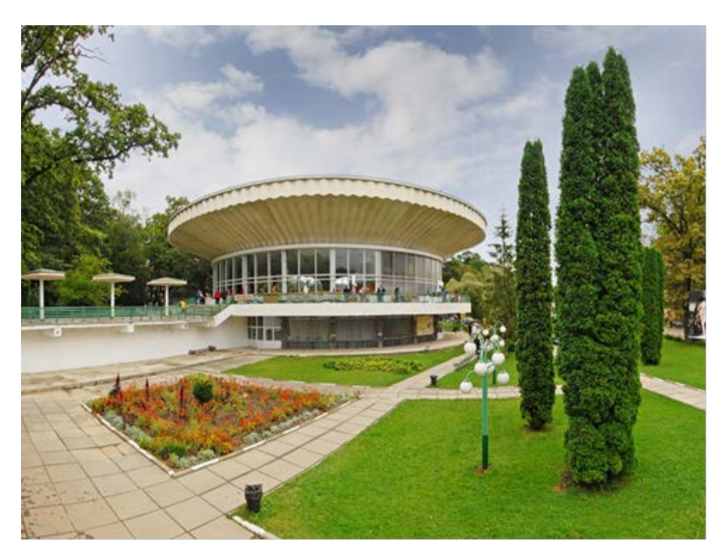
Figure 4. Morshyn Mineral Water Beauvet

Underground water sources No. 4, of the source "Morshynskoe", located in the southern and north-eastern outskirts of the resort Morshyn, its composition is hydrocarbonate, sulfate-hydrocarbonate, chloride-hydrocarbonate without specific components and properties. The total mineralization is 0.1-0.4 g / 1.The chemical formula is as follows: