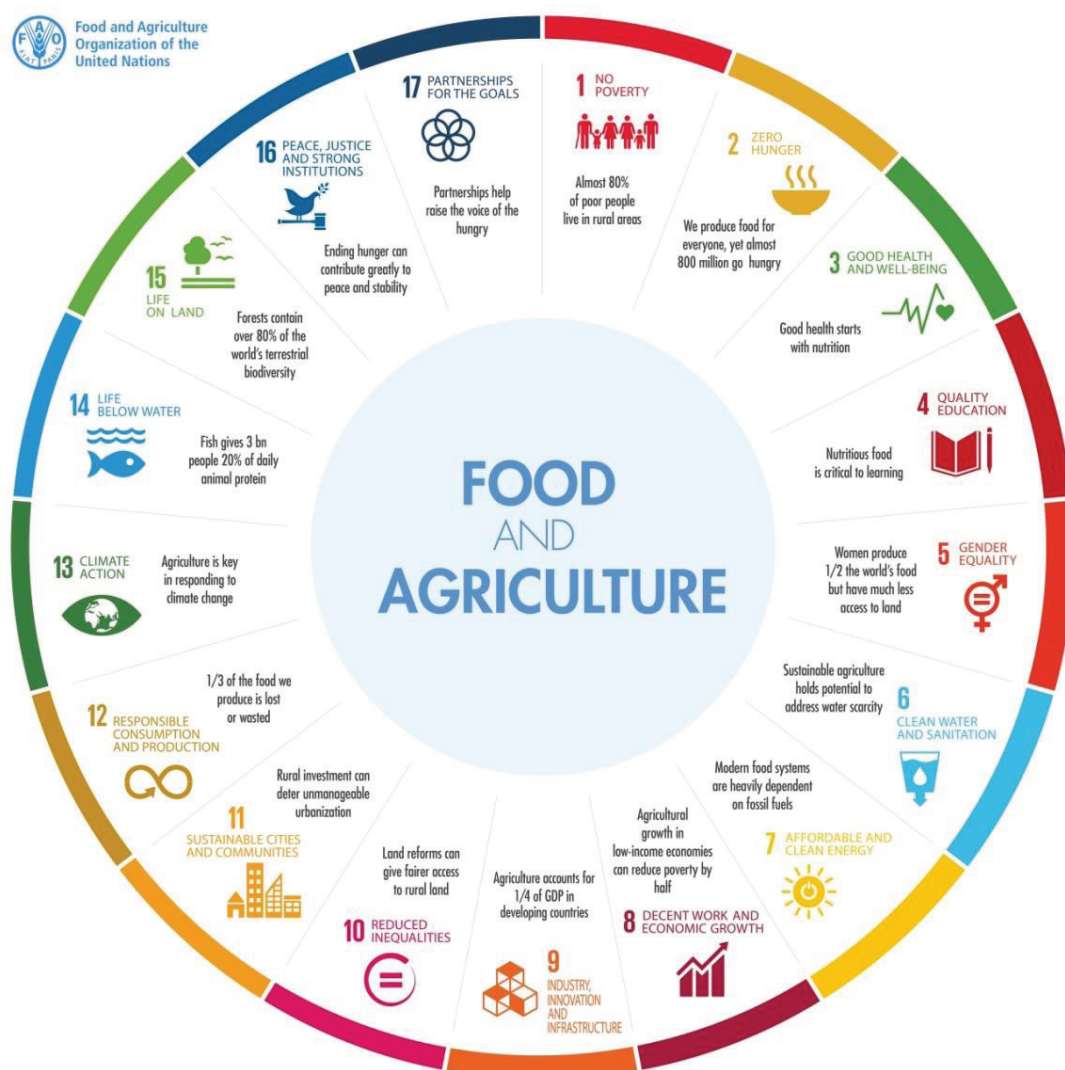
Figure 1. Sustainable Development Goals as an Infographic.

Poverty is a condition in which a person or community can't be met with basic human needs essentials for a minimum standard of living which is a curse for a civilized society. Rural poverty is more severe while comparing it with urban areas. Approximately four-fifth world's extreme poor globally reside in rural areas (Castaneda et al., 2018) majority are found in developing countries, with diminishing livelihood/ poor agriculture sector performance and inadequate infrastructure/ market facility. AGF being most multifunctional forms of agriculture and have a greater role in improving the rural livelihoods (FAO, 2004), also the most appropriate tool to eliminate rural poverty if implemented in a suitable environment with adequate design from local to the national level (Ahmad & Goparaju, 2017; FAO, 2018a). The study by Leakey et al. (2005) in many