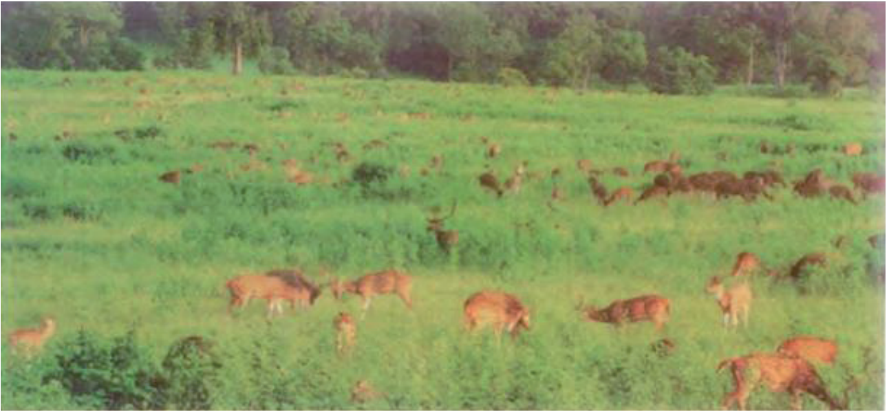
Figure 2. A large population of spotted deer and sambar grazing in the park