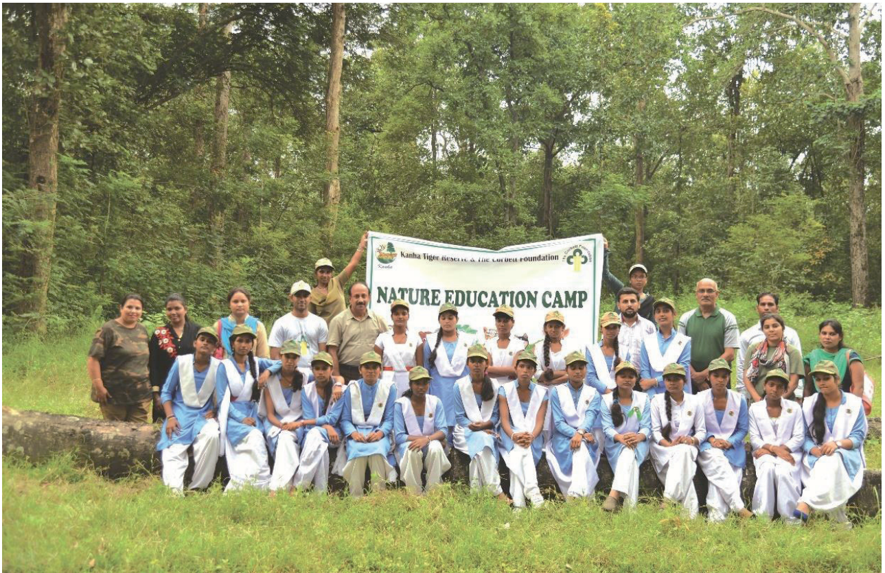
Figure 5. Nature education camp organized in 2016-17 at KNP for school children

There are 140 Eco Development Committees (EDCs) in buffer zone of the park formed under joint forest man-