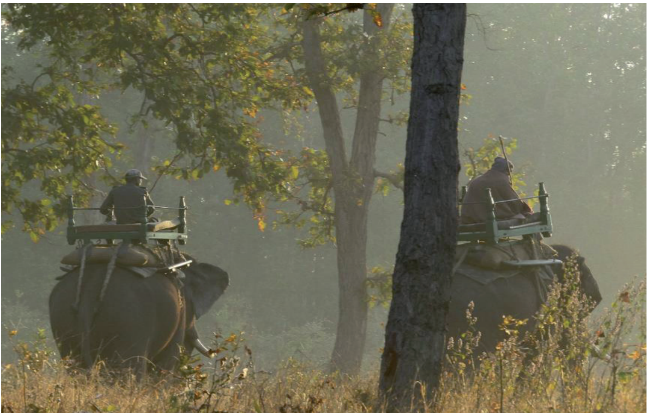
Figure 4. Elephant patrolling in Kanha National Park

Management of other species - Kanha is known for management activities for tiger and Barasingha but there are other vulnerable species as well such as black buck and mouse deer. Park is taking no initiative for such species. Kanha National Park has resources and expertise in management of vulnerable species. So efforts should be