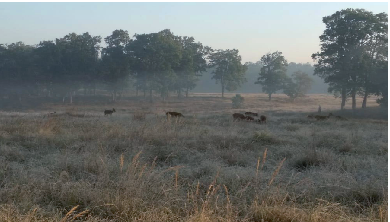
Figure 3. Grass height is a deciding factor for Barasingha at KNP