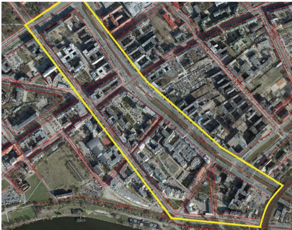
Figure 1. The area of monitoring and conducting the analysis and research (marked by the yellow line)

In the examined period of 5 years between 2011 and 2016 the analysis of the inventory and the verification of the conditions of the tree stands on their basis was assigned. In the paper the inventory of the street trees within the streets: Solidarności, Targowa, Zielenieckiej, Zamojskiego and Jagiellońska (Fig. 1) was conducted. This field of Praga North (Polish: Praga-Północ ), which represents the district of Warsaw, is highly-urbanized. The inventory was carried out in February in 2016. During the process, the tree species and trunk circumference on the height of 130 centimeters were considered. Additionally, the trees were described in terms of the condition and location. As previously mentioned, a similar inventory was conducted in 2011 and thereby an opportunity to compare the changes