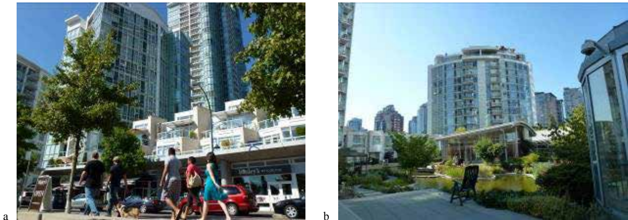
Figure 1. Mixed-use development in Yaletown part of downtown Vancouver: a) services and city villas located in the podium of residential towers, b) community spaces situated over the podium

are single basic elements such as sustainable : ‘urban planning’, ‘city’, ‘architecture’, ‘development’, ‘housing’, etc.