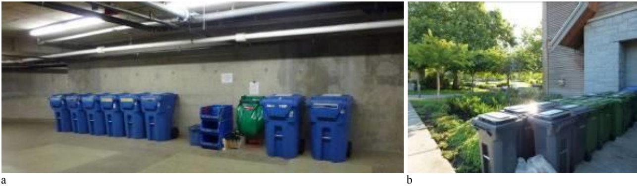
Figure 4. New standard view of various containers: a) in a garage of a residential tower in Yaletown, b) outside public buildings at the University of British Columbia