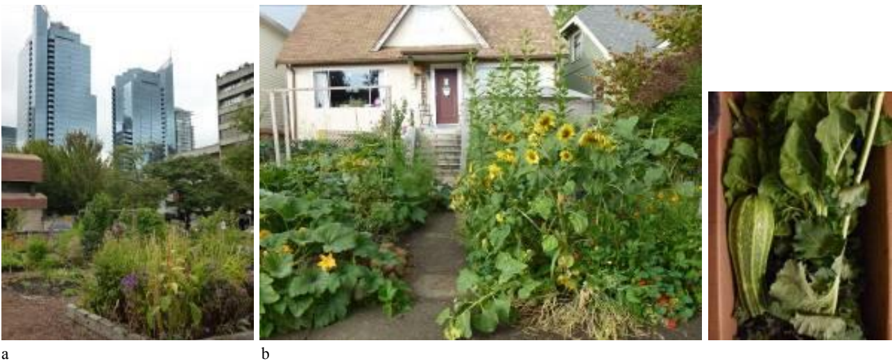
Figure 5. Local food production: a) community garden located in the city centre surrounded by public buildings, b) private garden used as an urban farm in exchange for veggie-boxes

and lending libraries for things like tools, toys and vehicles. One also popularizes a cradle-to-cradle design among producers that is a design in which an entire life cycle of a product is taken into consideration (McDonough & Braungart 2002). A very important point is that the waste created through the construction of new buildings or the demolition of old ones is recycled in 76%. Moreover, food scraps, compostable paper, yard trimmings, and other organic waste make up about a third of Vancouver waste stream. That is why composting from single-family households, piloting a collection programme from apartments and condominiums, and ensuring compostables also from business and institutions, are strongly promoted.