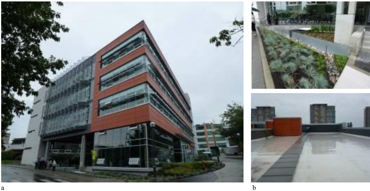
Figure 6. CIRS at the UBC: a) building, b) rainwater distribution around the building and rainwater collecting on the roof