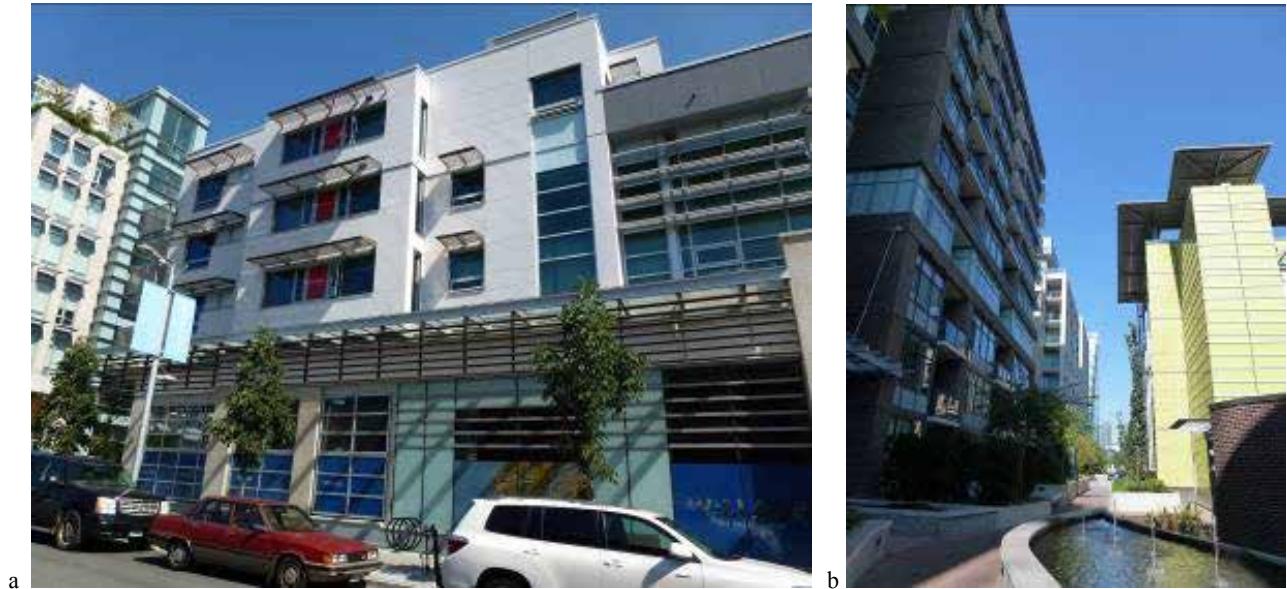
Figure 2. False Creek Development – The Olympic Village: a) diverse sun protective screens, b) rain catchers on the roof