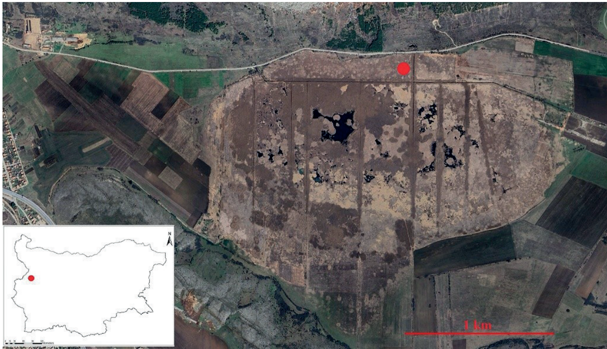
Figure 1. Location of the study site and position of the audio recorder

For the automated acoustic analysis, we used WaveSurfer version 1.8.8 with the SoundMeter plugin (Farina et al., 2012), which provides calculations of several ecoacoustic indices. Specifically, we extracted three indices: Acoustic Complexity Index (ACI), Acoustic Diversity Index (ADI), and Acoustic Evenness (AE). ACI estimates the variability in amplitude between successive time steps within frequency bins, and reflects the complexity of the soundscape. In our analysis, we used a variation of ACI that measures complexity occurring within a single amplitude clump inside each frequency bin, as implemented by the plugin. ADI is based on the Shannon entropy of the distribution of sound energy across frequency bands, and captures how diverse the spectral content is in a given recording (Sueur et al., 2008). AE, in this plugin implementation, measures the evenness of ACI values across frequency bands, rather than the raw amplitude distribution — a slightly different formulation from Gini-based versions in other toolkits (Farina et al., 2012).