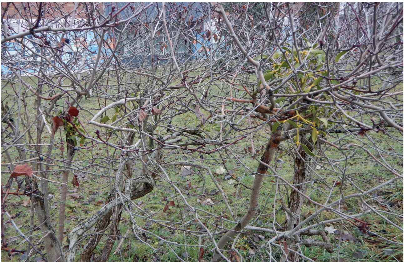
Figure 3. Specimens of black hawthorn infected with mistletoe at site I in grid square CD3061

The information presented above demonstrates that, in view of the likely changes in the species affinity of the infested oak trees and the process of hybridization, research aimed at assessing the resistance or susceptibility to mistletoe parasitism requires genetic analysis, both of the hemiparasite