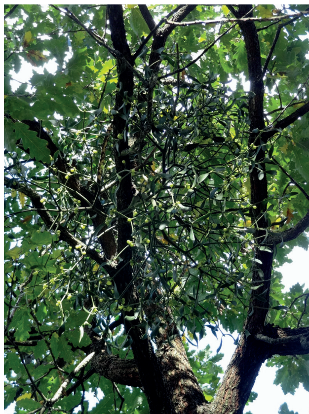
Figure 2. Mistletoe-oak in Barbarka Forest (photograph by M. Kunz on 6 October 2022)

Of the eight taxa listed, five were not included by Barney et al. (1998) on the list of Viscum album subsp. album hosts: Crataegus nigra , Prunus serrulata , Robinia x margarettae , Sorbus austriaca and Tilia x juranyiana . The lists compiled by Bojarczuk (1971) and Stypiński (1997) do not list any