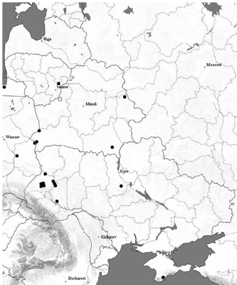
Figure 1. Distribution of Cytisus scoparius on the eastern border of the range until 1900

In generalized work about the plant's horology, issued at that time in Ukraine, C. scoparius was attributed to run wild plants (Barbarych, 1955; Kleopov, 1990). Herbarium data are supplementing the picture of geographical distribution of C. scoparius in Ukraine in the first half of the XX century. Herbarium labels confirm that process of cultivating of C. scoparius was continued. Thus, the specimen of C. scoparius from village Antoniny (now Khmelnytsky region) (Kucheriava, 1932, KW) is accompanied by a label with information about cultivation of C. scoparius in forests as food for hares. From place of cultivation it has spread to nearby areas in the Carpathian Mountains, in Volhynian-Podolian Upland, on Polissya lowlands and reached the Dnieper Upland (Cherkasy region, surroundings of Talne town) (Kosets & Syvoholovko, 1936, KW) (Fig. 1).