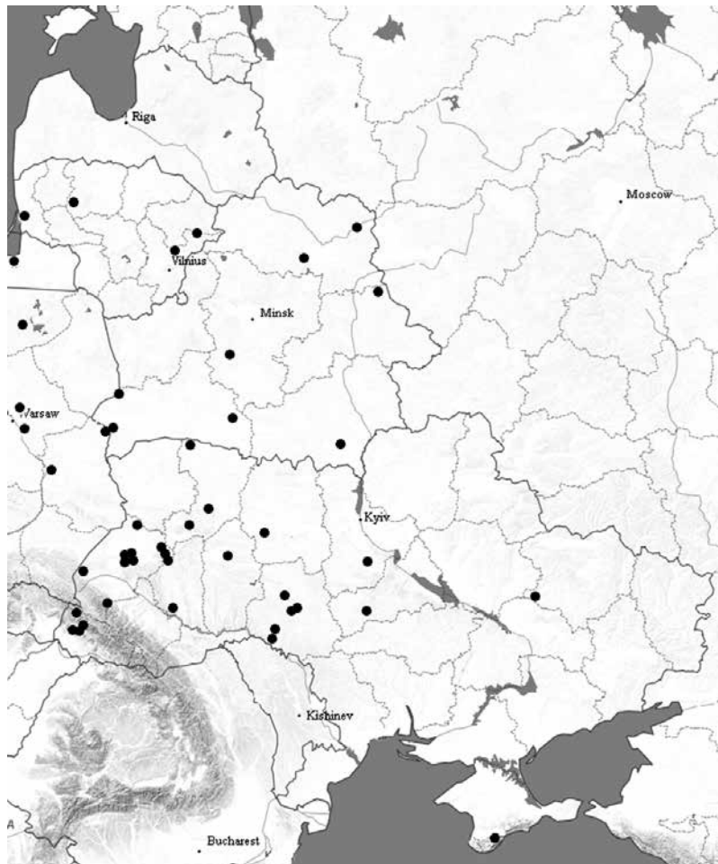
Figure 2. Distribution of Cytisus scoparius on the eastern border of the range until 1950

There are differences in character of geographical distribution of C. scoparius on Polissya lowland and on Volhynian-Podolian Upland. Available information about locations of C. scoparius in Polissya does not fully reflect the picture of modern geographical distribution of the species in this region. Obviously, there are much more localities than registered by researchers. The species has become so widespread in Polissya in recent years that fixed by botanists in every corner on the Right Bank of Polissya. According to the significant similarity of geographical conditions of the various parts of the region and the large number of ecotopes suitable