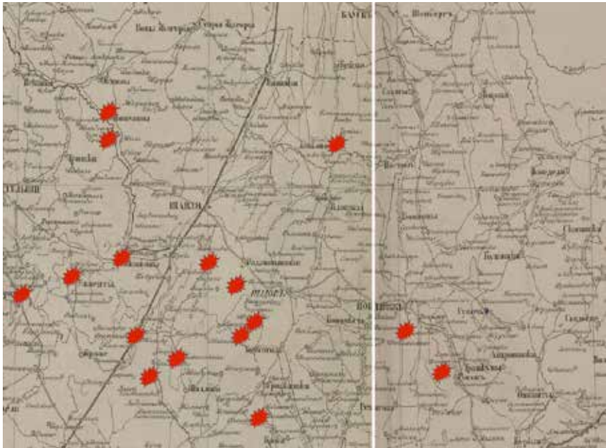
Picture Nr. 2. The battles between insurgents and Russian troops in Northern Lithuania where guerrilla tactics were used (1863)

Map was created using Подробный атлас Российской империи съ планами главныхъ городовъ. 1871, С. Петербург 8 .