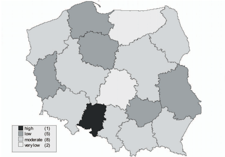
Fig. 1. Classification of voivodeships on the basis of development measure in 2006 (I Arrangement of features)

The results of classification of voivodeships into typological groups in accordance with the development measure are presented in Table 4 and their graphic representation is shown in Fig. 1 and 2. The first group includes