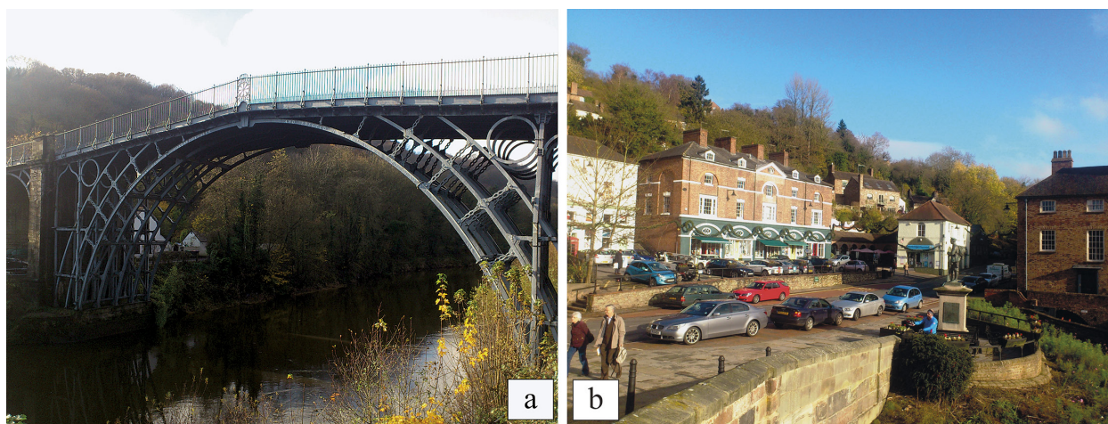
Fig. 4. The Iron Bridge and the town

ern end of the town of Ironbridge developed rapidly (Fig. 4). A new town square was built, as well as new shops and houses. In this way, the bridge became a town-creative factor and contributed to the development of a new destination, whose name derives from it: the Town of Ironbridge (The Iron Bridge and Town, 2010). At present, the most important tourist attraction in the town of Ironbridge is the Bridge and the Tollhouse situated next to it. Going westwards, we can find another interesting facility – the Museum of the Gorge, with information, materials and presentations regarding the natural environment and the history of industry in the Ironbridge Gorge.