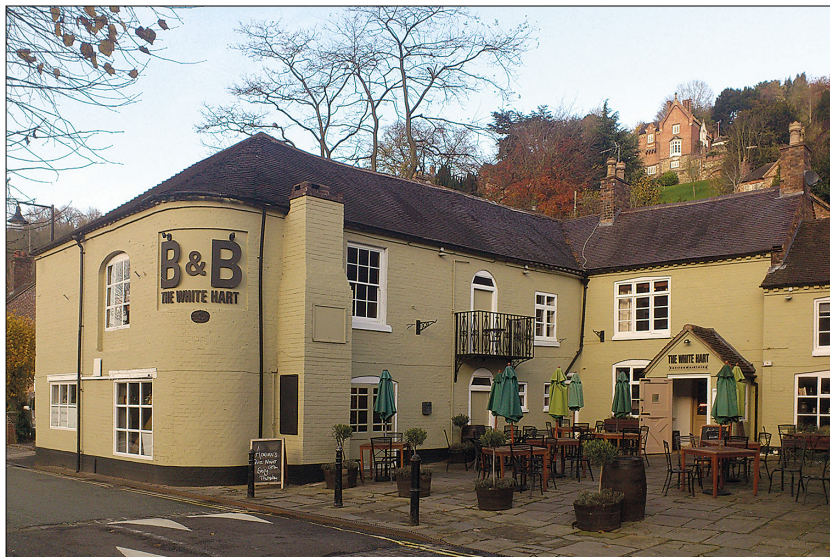
Fig. 6. One of restaurants and accommodation facilities in Ironbridge Town.

Moreover, the Ironbridge Gorge is an important tourist destination generating substantial income for local business. On the TripAdvisor website, we can find over 6300 reviews of the Ironbridge Heritage Site (January 2015.). It is estimated that the Ironbridge Trust generates around £20m of income annually, which is a part of the visitor economy of Shropshire area. ( http://www.ironbridge.org.uk/about-us/ironbridge-gorge-museum-trust/facts-and-figures/ ). According to http://www.ironbridgeguide.info/ , there are 17 different accommodation facilities, 5 main shopping areas, and 10 large restaurants and pubs serving tourist services in the Ironbridge Gorge (Fig. 6).