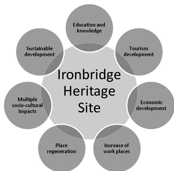
Fig. 7. Functions of the Ironbridge Heritage Site on the local and regional scale

The main aim of this article was to show that a World Heritage Site functions may have a significant and varied influence on the local and regional development. The author wanted to prove it using a specific example of the Ironbridge Gorge in the United Kingdom. It should be stressed that the majority of the heritage functions described in literature are confirmed in this particular case study (Fig. 7).