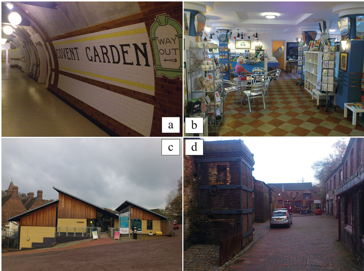
Fig. 5. Jackfield Tile Museum and its surrounding institutions

constructed and adjusted to the needs of an open-air museum. The area includes houses, shops and workplaces, pubs, restaurants and cafes, where customers are served by appropriately trained employees, dressed in historical costumes. In this way, the place acquires the look and atmosphere of a small industrial town from the end of Queen Victoria's era.