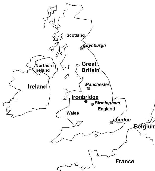
Fig. 1. Location of the Ironbridge Gorge

The Ironbridge Gorge is a heritage site covering about six miles of the River Severn Valley, situated in Shropshire County, West Midlands, England (Fig.1). It is a hilly area with a deeply cut river valley, called the Ironbridge Gorge. There are several small destinations situated there, such as Coalbrookdale, Ironbridge, Broseley, Jackfield, Madeley and Coalport (Fig. 2). The Ironbridge Gorge is known as the cradle of the Industrial Revolution (Alfrey, Clark, 1993).