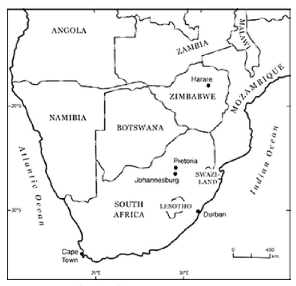
Fig. 1. Location map of Southern Africa

1997 and then again declining ever more precipitously after 2000 (Gumbo, 2013). The deteriorating economic climate was exacerbated by Zimbabwe's involvement in the 1998-2003 war in the Democratic Republic of Congo and by the controversial radical land redistribution programme which commenced in February 2000 (Kamete, 2009). Especially since 2000 Zimbabwe has experienced a period of well-documented sustained economic and political crisis. During 2006 Bratton and Masunungure (2006: 23) could observe that "faced with an economy that had shrunk by 40 percent over five years, an unemployment rate of 70 percent, and triple-digit inflation, many Zimbabweans had turned to the informal sector as a source of livelihood and survival".