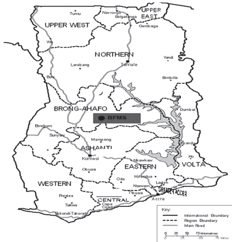
Fig. 1. Location of Study Area

savannah woodland of northern Ghana and the forest belt of the south. The vegetation on a whole comprises a mosaic of original forest, degraded forest, woodland and savannah. The crops cultivated in the District include maize, yam and cassava.