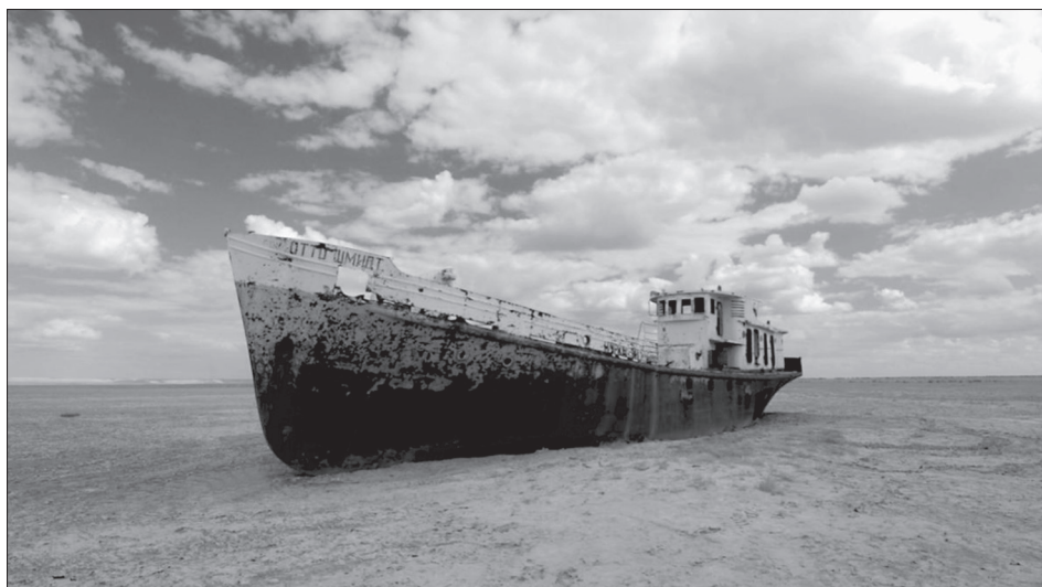
Photo 1. A desert-bound maritime vessel on the former Aral Sea bottom near Ak Basty, Kazakhstan

A single image, made by the author on the former seabed of the Northern Aral Sea near Ak Basty, Kazakhstan in September of 2011 (Photo 1) will serve as a vehicle through which the geographical framing will be guided.