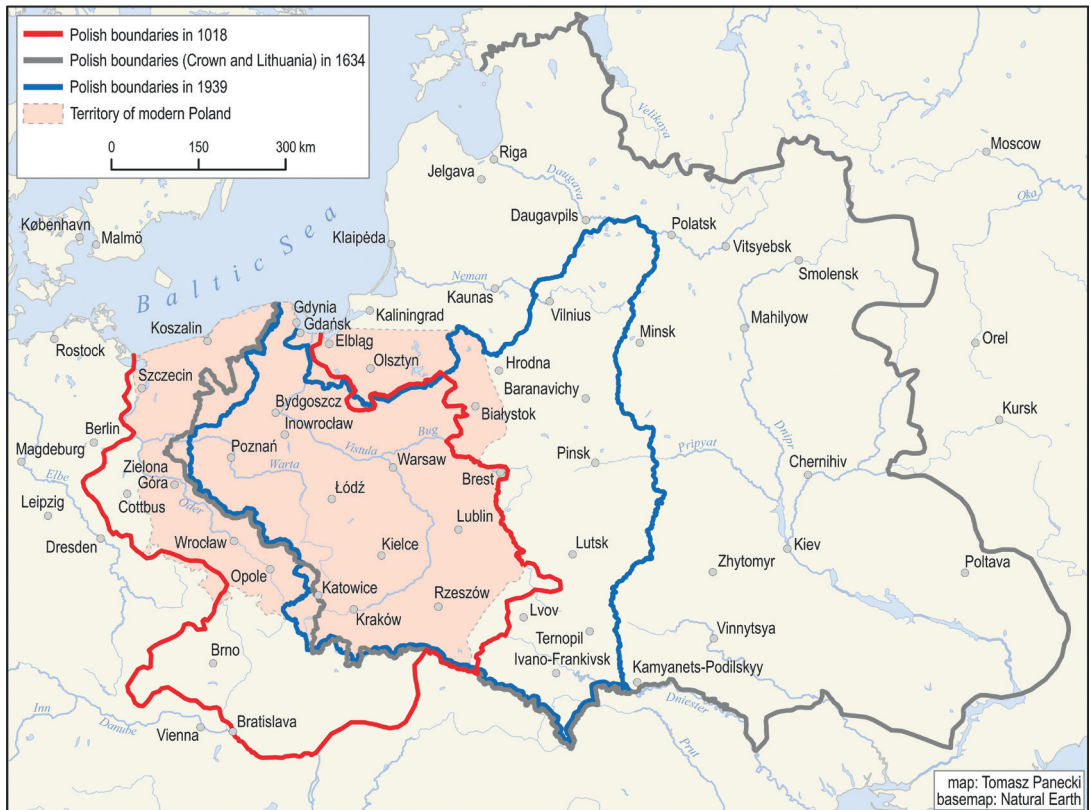
Fig. 1. Polish boundaries from 10 th to 20 th century

on the placement in relation to the landscape, borders could be either categorised as natural, determined by the aforementioned elements of the natural landscape, or artificial, determined by anthropogenic topographic features, such as roads, levees, canals, and mounds.