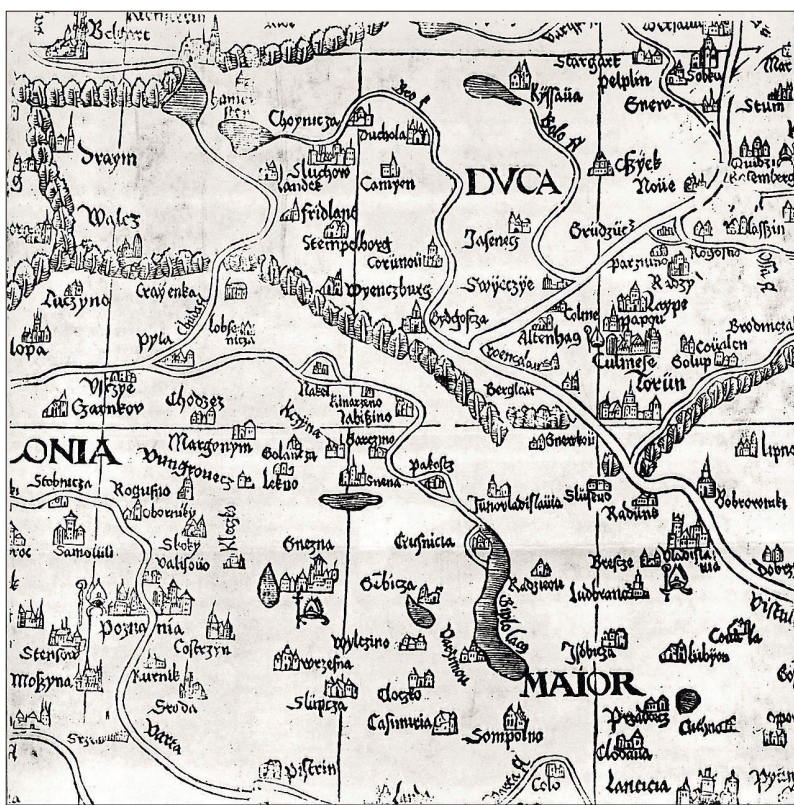
Fig. 2. Surviving fragment of Bernard Wapowski's map

From the late 15 th century, hand-painted woodcuts and copperplate copies of maps started to emerge, to make a distinction between countries, states, and provinces using colour. With the lack of clear delineated borders, these maps often contained significant errors. The inclusion of borderlines on carvings was slowly introduced in the span of the 16 th century; Poland did not lag behind in this field, which could be attributed to the founding father of Polish cartography, the aforementioned Bernard Wapowski (ca. 1475–1535). His cartographic opus magnum was a grand map of Poland and a greater part of Lithuania (scaled at around 1:1,000,000). The woodcut was printed in Cracow, together with two other maps by the same author. Presumably only a portion of the prints managed to be released into circulation before a fire consumed the printing