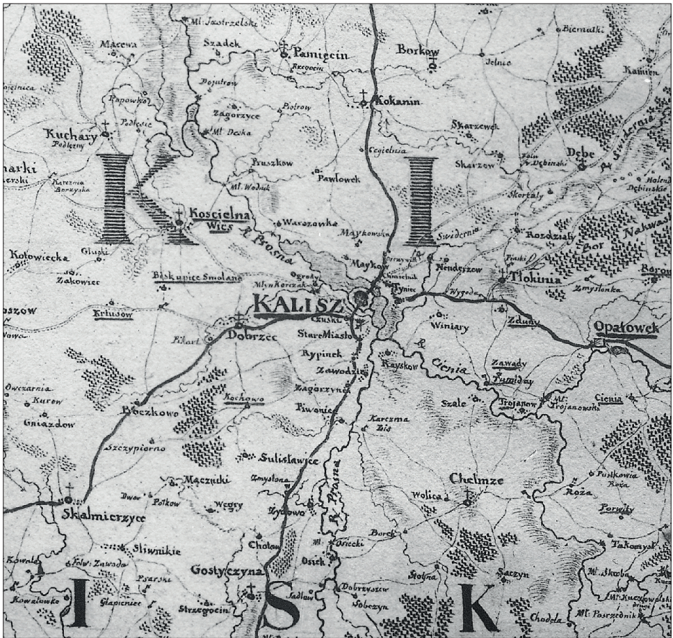
Fig. 4. Fragment of Charles Perthée's "Mappa szczegulna" ("Separated map")

of Zator, into the Kraków voivodeship in the years 1563 and 1564; the duchies were turned into a single district within the voivodeship.