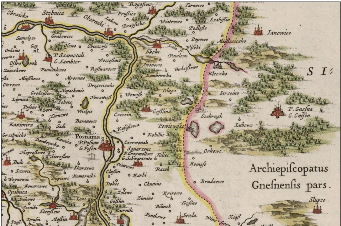
Fig. 3. Fragment of Godfried Freudenhamer's map – borderland between Poznań and Kalisz voivodeships

its shortcomings, Freudenhamer's map belongs to the best cartographic sources of its time 20 .