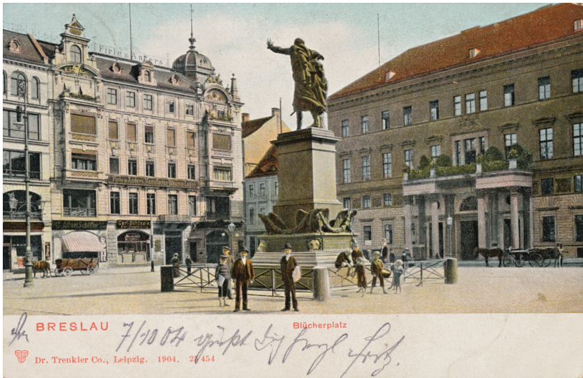
Fig. 2. View of the Old Exchange (on the right) and of Feld-marshal Blücher's. Dr. Trenkler's postcard, Leipzig, 1904.

named 'the Exchange'; fundamentally, though, it was a venue of social life. The magnificent first-floor rooms set the scene for concerts, balls, diverse meetings, and exhibitions. These palace-like interiors invited local Protestant and Catholic elites – the crème of Breslau's bourgeoisie and nobility – over dozens of years. 92 Being the most beautiful and most frequently visited (along with the local theatre) public-utility building in the Silesian capital, the Club marked a poignant exclusion of townsmen of Jewish descent. 93