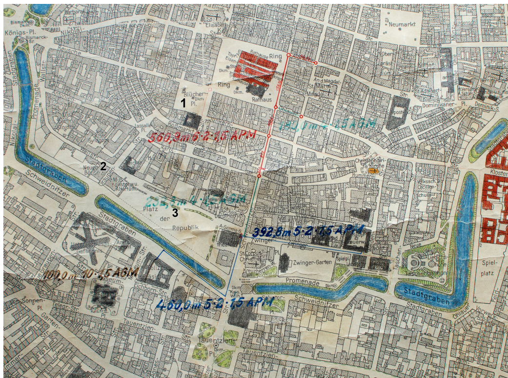
Fig. 1. Plan of Breslau of 1935. 1. Old Exchange of 1825, Solny Place 16 (Blücherpl.16), 2. New Exchange of 1867, Krupnicza 15 (Graupenstr.15), 3. Royal Forum - the 40s of 19th c. Private collection