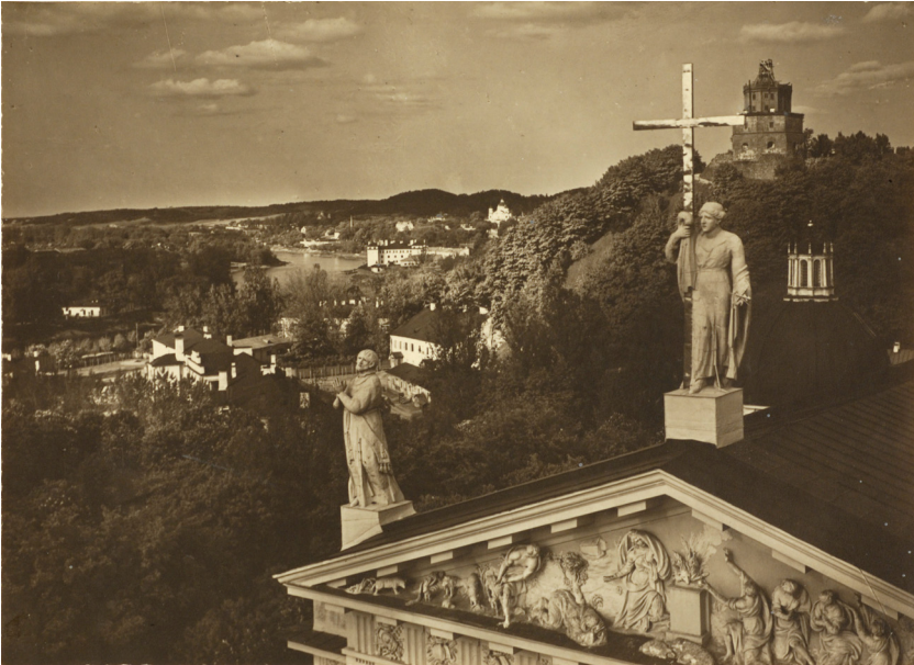
Fig. 5. Jan Buhak, Vilnius from the cathedral campanile , ca. 1915.

from Jena University, appointed in winter 1916 as the conservator of Lithuania responsible for the registration of architectural monuments in the region. During his surveys, he organised popular lantern lectures addressed to German soldiers on the cultural and artistic landscape of the conquered lands, focusing in particular on Vilnius and illustrated almost exclusively with Buhak's slides. The most captivating panoramas, views of the city and single monuments also filled the pages of Weber's booklet edited by the Zeitung der 10. Armee . 53 Wilna. Eine vergessene Kunststätte , defined in the introduction as a guide and a souvenir for the German soldier, was a comprehensive art history of the city's monuments filled with 135 illustrations. Starting with 7 encaptivating panoramas of the city, it continued with the views and details of the monuments under discussion. As already mentioned, the majority of illustrations consisted of Buhak's survey photographs, which formed a visual narration in its own right. In the opinion of the German Kunststoffiziers on the Eastern Front, it was as important