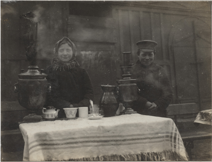
Fig. 2. Behmcke, A boy and girl with a samovar at the Łęczycza market, ca. 1917; Cracow, Ethnographic Museum, inv. no. III 17419.

possibly soldiers or military officials, whose names do not appear on the lists of the Kommission's employees. Surprisingly, this collection goes well beyond the scientific and reveals several photographic personalities. Behmcke's pictures of the Warsaw Jewish sellers or of the Łęczycza region peasants are taken with an artistic eye and sensibility, and should be described more in terms of artistic portrait studies than ethnographic typology (fig. 2). Hans Praesent, the Kommission's librarian and scholar responsible for statistical research, was particularly fascinated by the street market scenes of the towns and villages. Arved Schultz took numerous picturesque ethnographic impressions of the crowds before Sunday mass, playing children, and women carrying water.