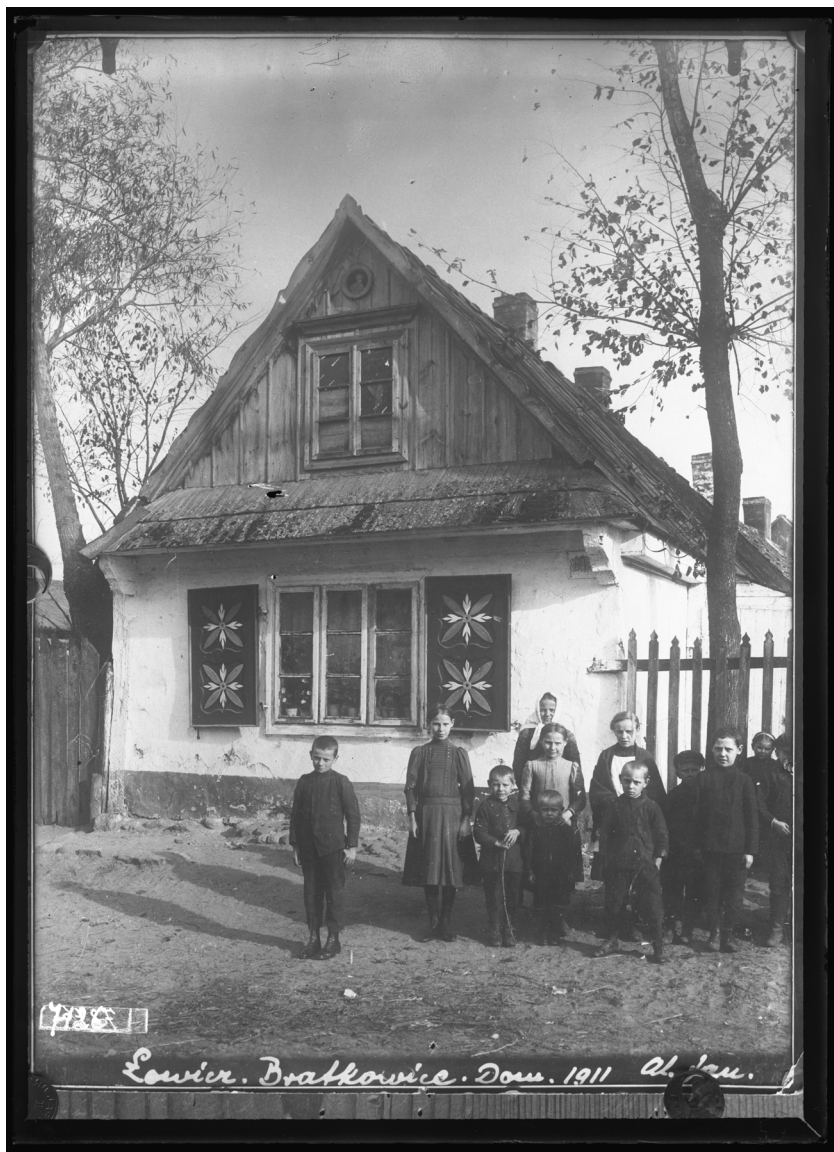
Fig. 4. A photograph from the Society for the Protection of Ancient Monuments' archive reproduced in the Wieś i miasteczko (Warszawa, 1916) and the Polnishes Bauernhaus (Berlin, 1917).