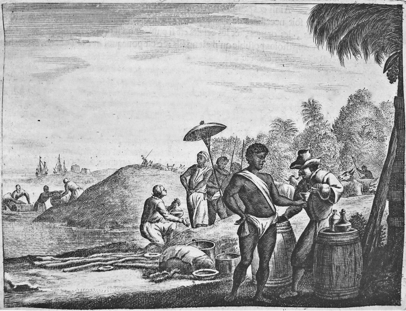
1. Olfert Dapper, The trade between the Europeans and the Africans on the shore of West Africa

Behind the first scene a European merchant with his head uncovered kneels before the local ruler, most probably that of one of the states of the Wolof people. The merchant is holding a bottle in one hand and is making a gesture of greeting and honour with the other. Most probably he is also offering a drink as a gift to begin trade negotiations. The ruler is recognisable by the attire covering his entire body, 25 as well as by the parasol held above his head by his suite made up of two persons. The latter are only wearing sashes on their hips but are armed with spears.