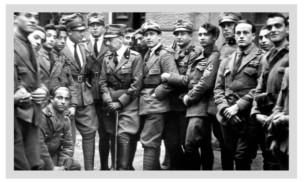
3. Gabriele D'Annunzio (leaning on a walking stick) among his supporters in Rijeka in 1919.