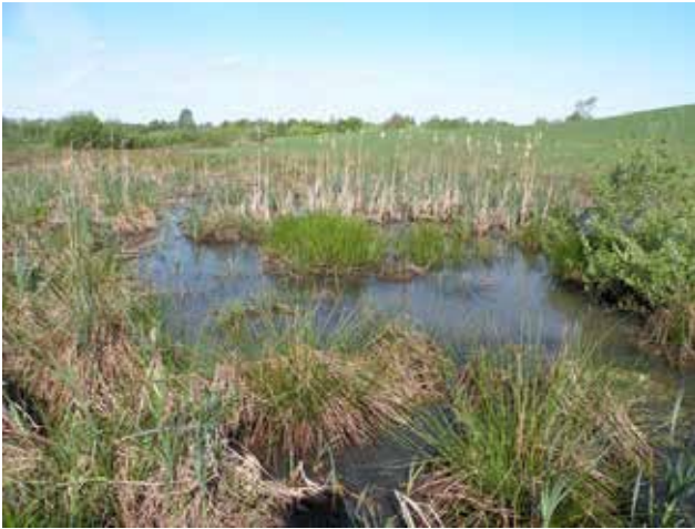
Figure 5. Astatic midfield reservoir situated in the vicinity of Samławki