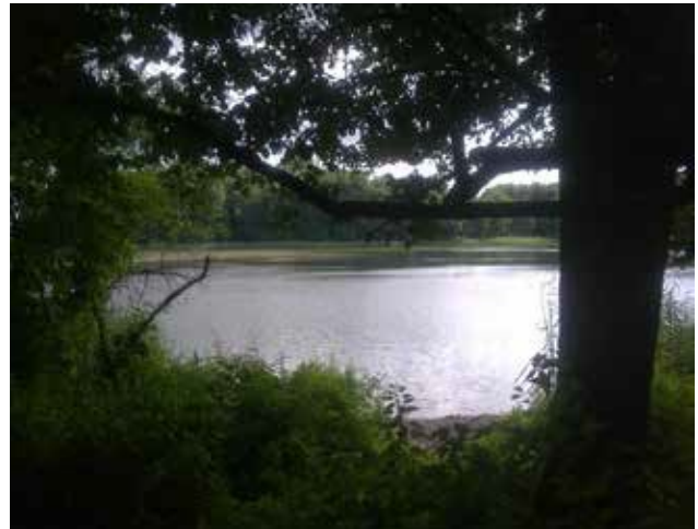
Figure 2. Skanda Lake

The leeches were collected during the fieldwork in the spring 2011 (April 14). It was single a collection of samples in the case of each reservoir. The qualitative method has been applied, which is based on finding a particular species. The species was identified in the way allowing survival of the individuals on the base of morphological characteristics or conducting later analyses at the laboratory. The material was collected from the plant as well as stones and objects situated on the reservoir bottom. The individuals were preserved in 96% ethanol.