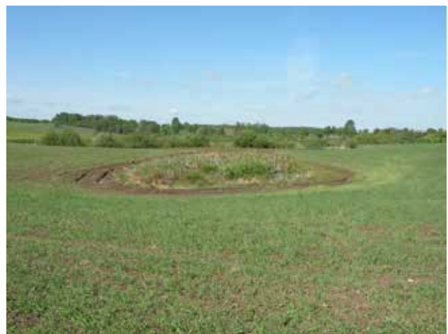
Figure 4. Astatic midfield reservoir situated in the vicinity of Samławki