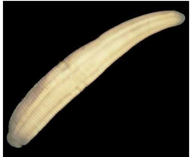
Figure 6. Dina lineata , dorsal view