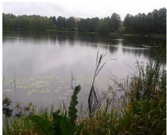
Figure 3. Redykajny Lake