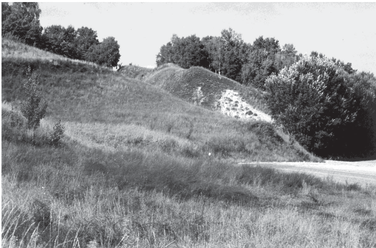
Phot. 1. View of the southern part of the nature reserve “Ostnicowe Parowy Gruczna” with eroded slope and relict locality of lichens

According to Ceynowa-Giełdon et al. (2004), Squamarina lentigera occurs in two nature reserves located in close proximity: “Ostnicowe Parowy Gruczna” – on the left bank and “Zbocza Płutowskie” – on the right bank of the Vistula River, at remote sites located (similarly to the above-mentioned species from the genus Gyalolechia ) more than 250 km from their nearest localities in southern Sweden and in southern Poland. Furthermore, Squamarina lentigera (like G. fulgens ) occurs also at the lower Oder (Tobolewski, 1980; Fałtynowicz, 1992; Wieczorek & Schiefelbein, 2014) which, similarly to the lower Vistula, is characterised by relatively high concentration of steppe vegetation.